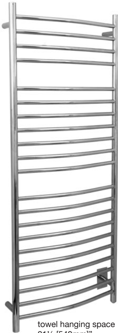
towel hanging space 21 1/4 [540mm]"